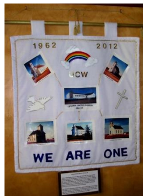
The Five Original Churches

The changes in family structure and size, along with a dwindling resource based economy, present new challenges and undertakings for Central United Church. As we embark in this new uncertain future, we trust in God more than ever for support and guidance to play the role God desires for us. We strive to continue our faith journey with the same spirit and enthusiasm as those faithful and dedicated members of our earlier churches.