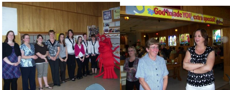
Annual Lobster Supper

Central United Church is fortunate when it comes to volunteers. They are found at times supplying for Sunday morning worship or special services. They may be spearheading a sing-song at a senior's residence or manor, or a fund raiser for some local church expense. They are seen heading to the basement each Sunday morning with the children to ensure their Christian education. They are doing little repairs or painting and fixing "odds and ends" on special work days. All church buildings and property are in good repair due to their dedication.