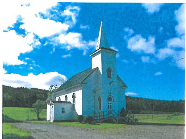
Southfield United Church 814 Route 865 Southfield, New Brunswick