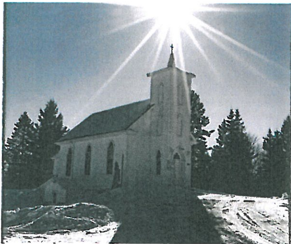
Salina Kirk Church 2259 Route 860 Salt Springs, New Brunswick