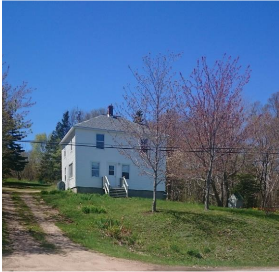
The Manse at Cape North