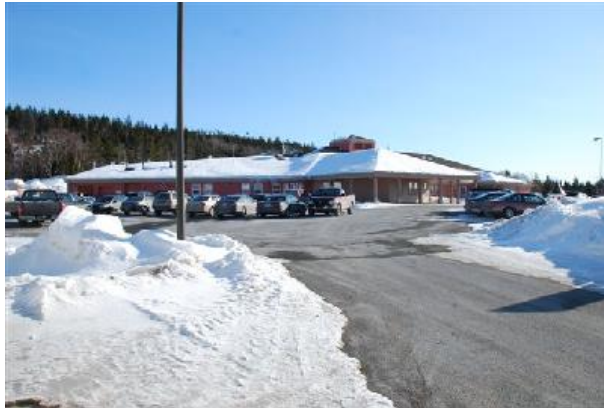
Buchanan Memorial Community Health Centre

Neil's Harbour is also the location of Buchanan Memorial Community Health Centre which serves the medical needs of the permanent population of about 3000 residents living in the communities of northern Victoria County. Services include a 10-bed in-patient unit, a medical clinic staffed by three full-time physicians, X-ray and laboratory services in-house, and emergency room services with a physician on call 24 hours. Other in-house services include public health, physiotherapy, occupational therapy, home care, dietician and palliative care. Visiting services include mental health counselling, addictions counselling, social services, and visiting consultants in internal medicine. There is easy access to more advanced diagnostic services and a full range of medical services in the Sydney area, a 2-hour drive away by car. The Emergency Health Service base (ambulance) with trained personnel is adjacent to the hospital. Buchanan Memorial also has a landing area for Medivac helicopters beside the hospital. There are two private registered massage therapists in the local area as well (in Dingwall and Ingonish). There is also a chapel located in the hospital area.