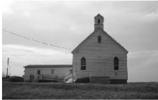
St. Andrew's United Church, Pleasant Bay

St. Andrew's United Church in Pleasant Bay was built in 1948, following a devastating fire which destroyed the first Church in 1947. Our Church is located approximately 31 km from the Manse. The stained glass windows are commemorated to the memory of those who lost their lives in the First and Second World Wars. Since that time, with determination and great volunteers, we have kept our Church in excellent condition. There is volunteer custodial service.