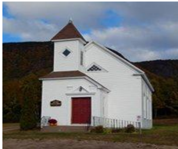
Aspy Bay United Church

The United Church Hall is located close by in Cape North. It has a well-equipped kitchen that is used for most of our fundraising events.