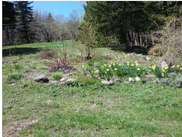
The backyard of the Manse

Our most important resource is our people. We have been without ministerial representation since February 2016 but have managed to carry on with services and to maintain a United Church presence in the Highlands. Two members of the Official Board Executive have recently become Sacraments Elders, the first in Maritime Conference, and can perform sacraments, when requested, for a maximum of one year. In addition, one member of St. Andrew's United Church has been trained as a licensed lay worship leader.