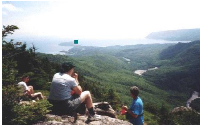
View from Broad Cove Mountain

The Ingonish area is home to a ScotiaBank with full service, a full-size grocery store, a liquor store, a convenience store, a funeral home, two hardware stores, a library with internet access, a legion, two post offices, and two fire departments (both with First Responders). Cape Smokey Elementary School, built in 2000, is also located in Ingonish. It is a modern school with classes ranging from Primary to Grade 5. All of the schools in the Charge consistently turn out happy, vibrant, and talented young people.