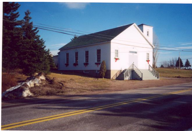
Ingonish United Church