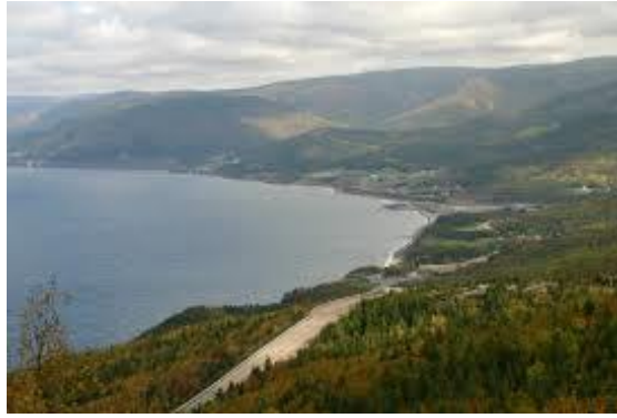
View of Pleasant Bay

Within the Cape Breton Highlands National Park, and just a few miles from Pleasant Bay, is MacIntosh Brook Campground, Big Intervale Campground and the most famous Skyline hiking trail. There are many hiking trails and activities within the Park.