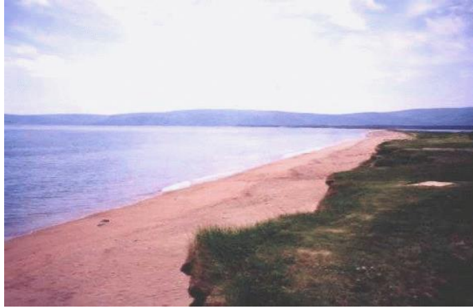
Cabot's Landing Beach, Sugarloaf/Cape North

Welcome to the North Highlands Pastoral Charge. We are located on the northern tip of Cape Breton Island with United Church congregations in Pleasant Bay, Aspy Bay, and Ingonish. We are two hours by car from Sydney and five hours from Halifax.