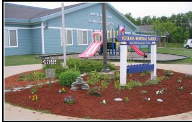
North Highlands Elementary School