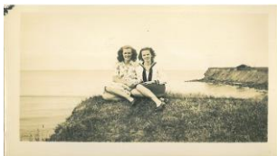
CGIT camp at Augustine Cove, PEI, 1947