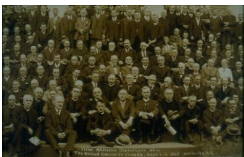
The first gathering of Maritime Conference, 1925

The Archives is mandated to collect, preserve, and provide access to the records of the Fundy St. Lawrence Dawning Waters Regional Council and Regional Council 15 of The United Church of Canada. These records include the pre-1925 records of the Presbyterian, Methodist, and Congregational congregations which joined The United Church in 1925.