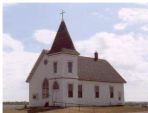
Summerfield United Church, Summerfield, PEI