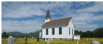
Escuminac United Church, Escuminac QC

Records help hold the church accountable by documenting the decisions made by church bodies. Archiving these records will ensure they are available when future generations need to draw upon the wisdom of those who have gone before them.