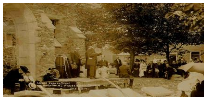
Wolfville Presbyterian Church, 1914

Records help hold the church accountable by documenting the decisions made by church bodies. Archiving these records will ensure they are available when future generations need to draw upon the wisdom of those who have gone before them.