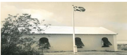
St. David's Methodist Church, Bermuda

The Archives serves a valuable administrative function by preserving and providing access to documents which are required for legal or decision-making purposes.