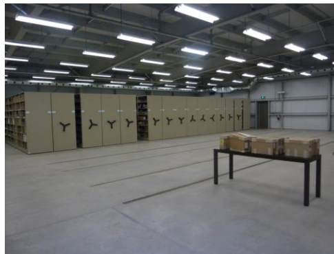
Archives storage vault

There is a monitored security system in place, including smoke detectors and sprinklers.