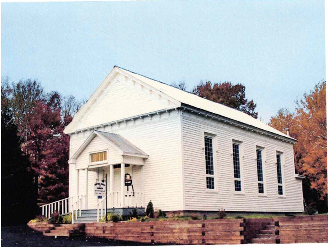
Scotchtown United Church

Although we are a prominent structure in the Community many are not aware of the work we do within our Community and